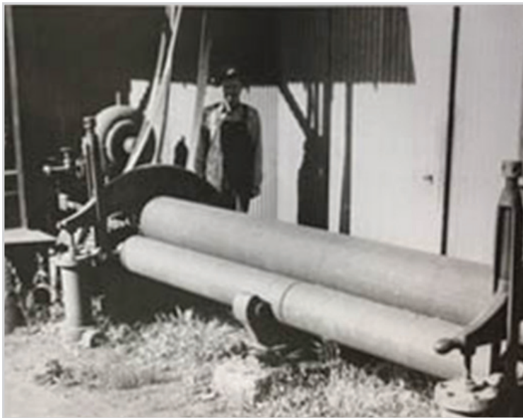
This pipe roller was built at Knight Foundry for use in the pipe shop to produce rolled and riveted steel pipe.

After discussions with contractors, the consensus was to stabilize the building with a series of internal wooden structures that will reinforce the existing beams and columns. The work is expected to be completed in early summer.