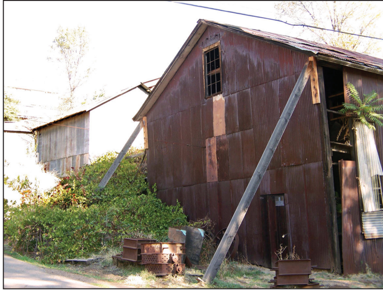
The Pipe Shop today – in need of support. Yours will help!

In its more than 100 years of life, the Pipe Shop building has become structurally unsound. The building's walls lean and even twist in place, and it is feared that it will not remain structurally sound much longer. Should it be demolished now? Or is there another way?